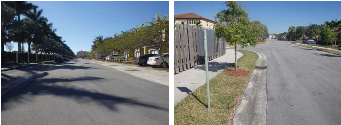
Onsite Roads in Good Condition